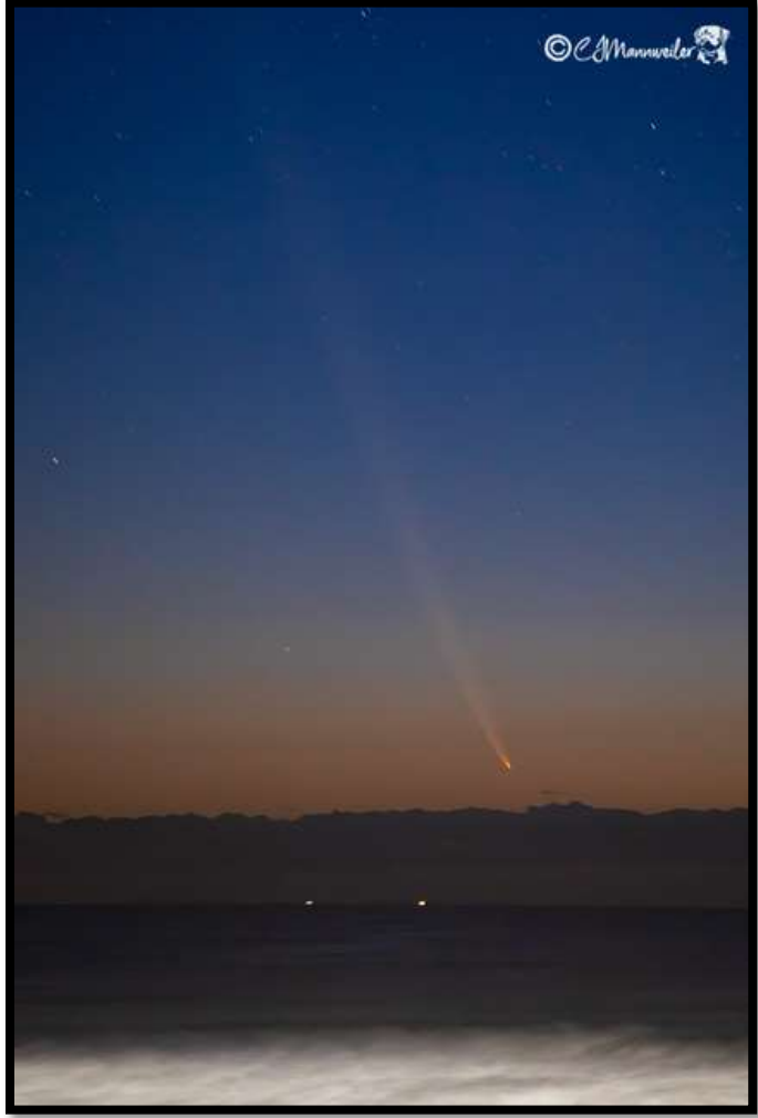
Rising comet C2303 A3