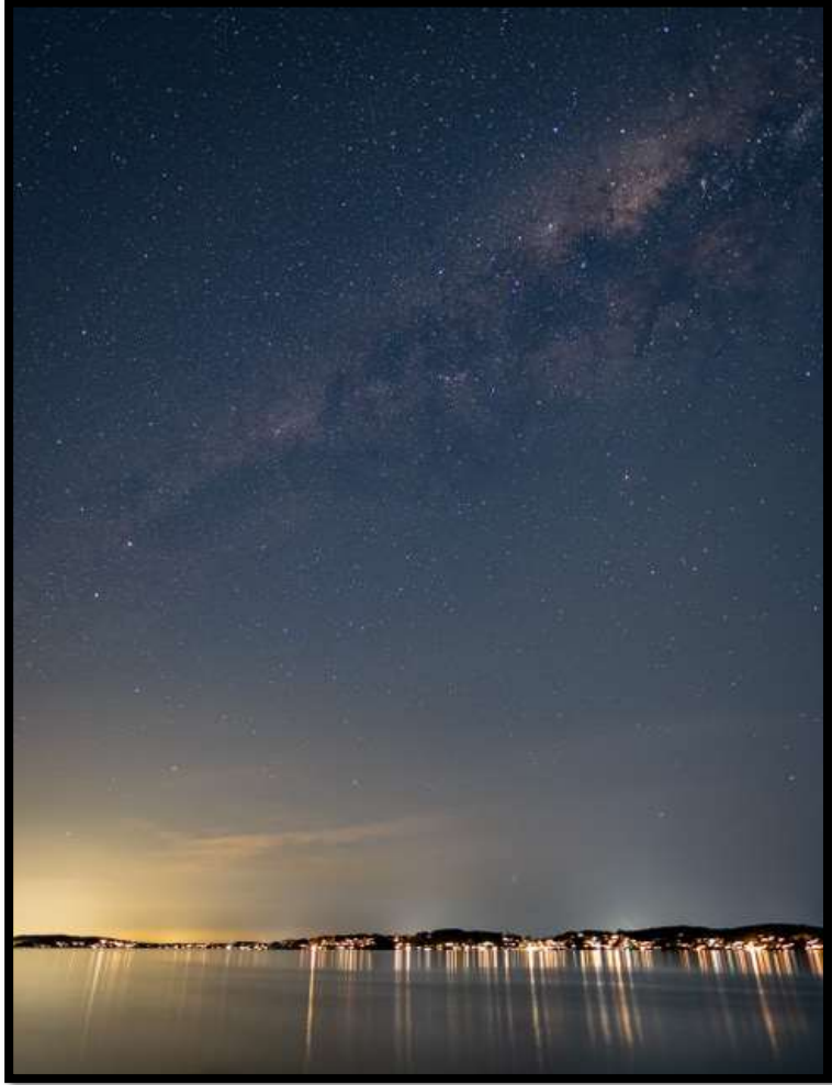
Looking south from Green Point – Annette Collins