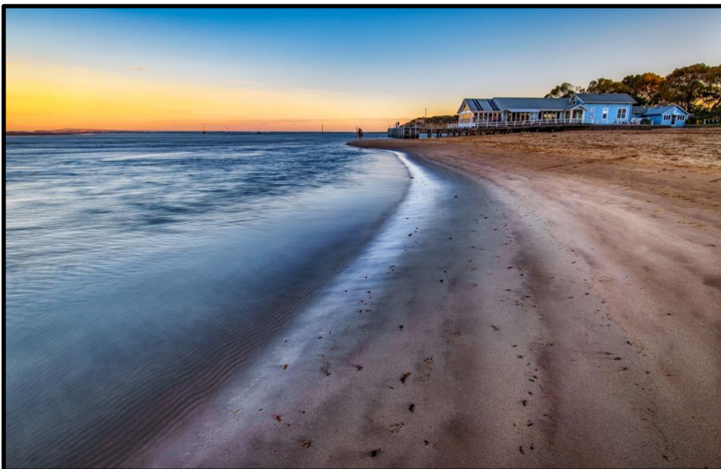
The Heads – Annette Collins

The definition for 'Afloat' is pretty straightforward – "Show me anything from an ice cube to an oil tanker as long as it is afloat".