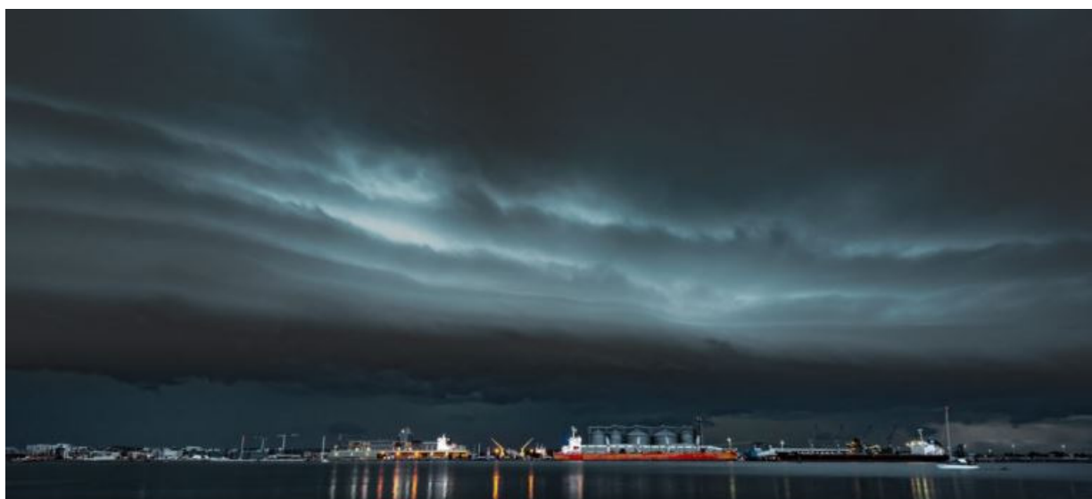
Layers - Sean Sylvester

Greg will try to bring some boards along to competition nights for members to purchase at $2 per board. If you know you require a large number of boards (eg more than 10), please contact Greg before the night via text or email.