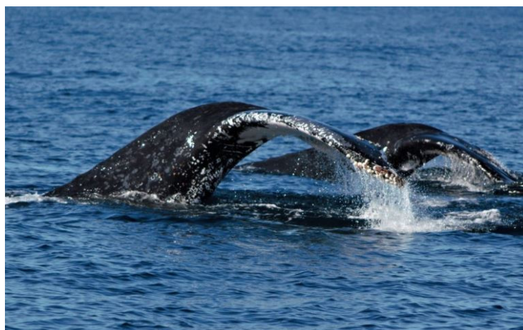
In Unison - Elica Petrovska