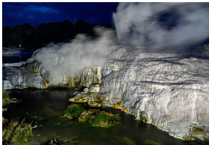
Night time geysers