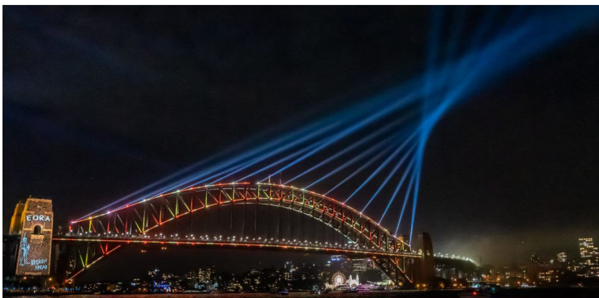
Vivid Bridge - Colin Woods