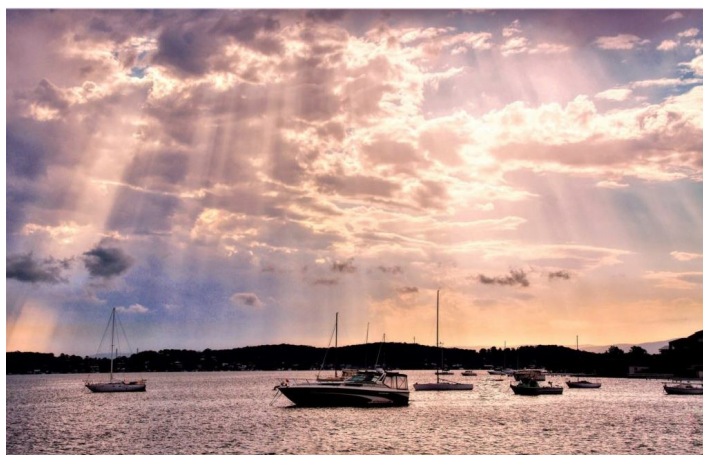
Afternoon Sun - by Elicia Petrovska

You will need to get a new 16s club membership card even if your 16s membership is not due. The card will be a different colour and must be shown to Annette Collins or text her a photo on 0417 693 888. Photos of cards can also be uploaded onto our website.