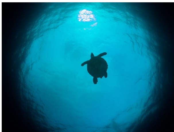
Going up for air - by Ian Medcalf

Please make sure you read the definitions for the Set Subjects for the following months. They can be found in the Members area on the Club website.