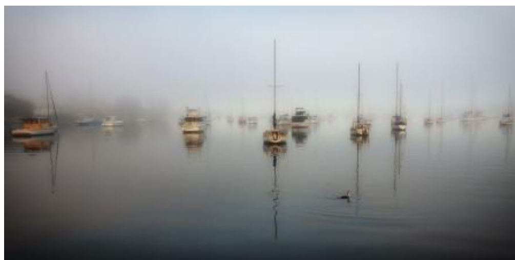
Ian Medcalf - 'Calm Anchorage'