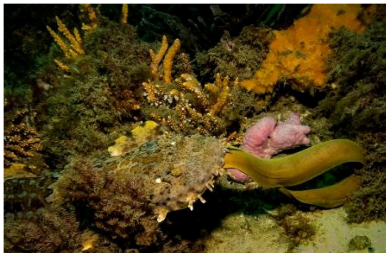
Garden of Eden - Trevor Cotterill