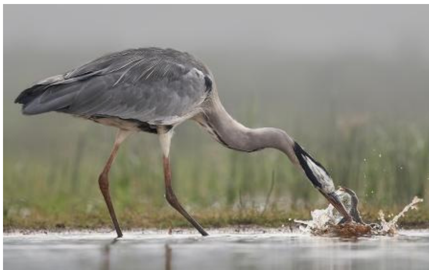
Grey Heron catching frog - Roy Killen