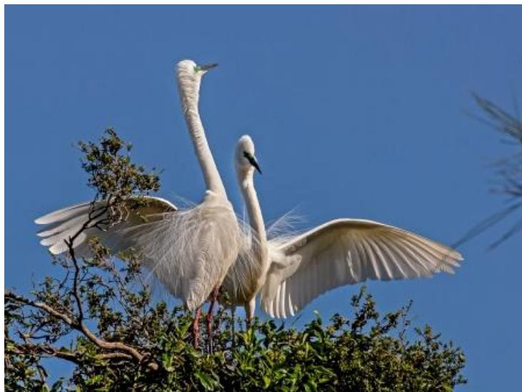
Great Egrets Courting - Neville Foster