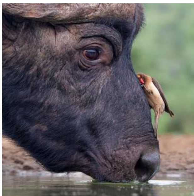
Roy Killen - 'Resting Ox-pecker' - Honours