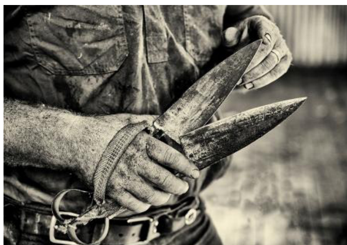
Margot Hughes - 'Blade Shearer'