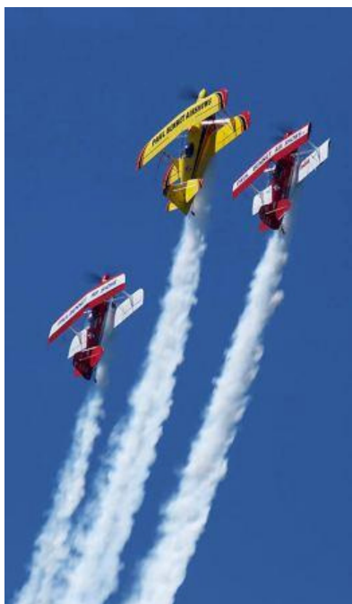
Dave Vane - 'Tiger Moths Era' - 10