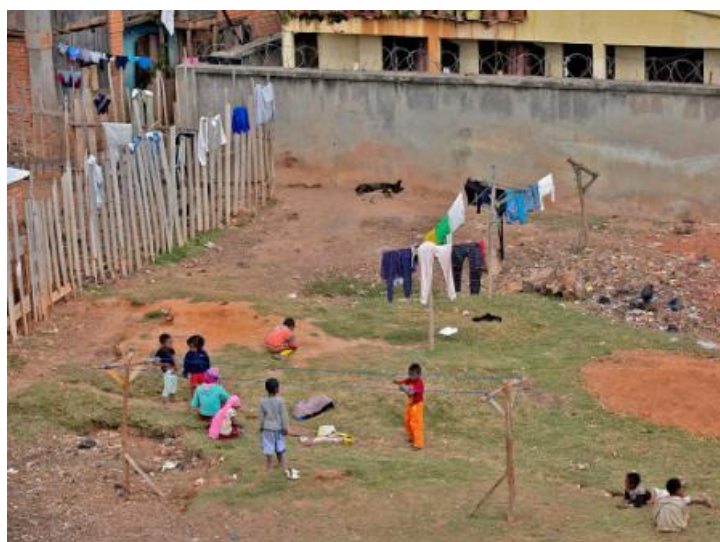
Susan Slack - 'Where do the children play' - 9