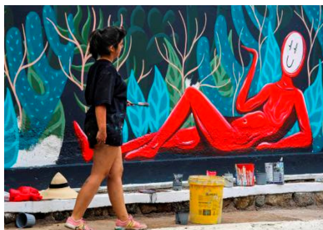
Alex Hunter - 'Hard Times' - 10