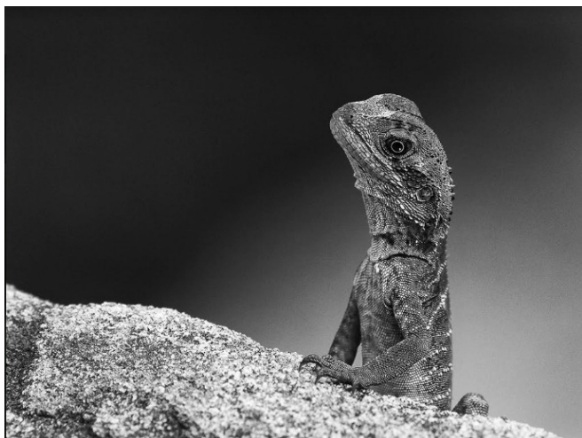
Juvenile Australian Water Dragon