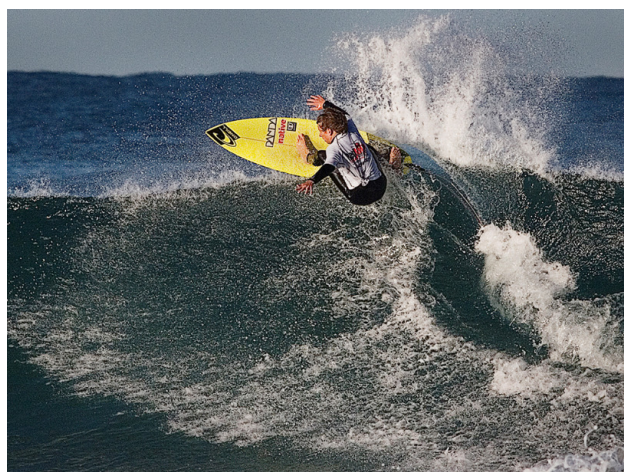
Flashing Yellow by Chris Prior

If you had an image selected in the first round of this competition please go to the competition page and remove your selected image or change it for another image. If your entry in Round 1 was not selected you can either leave it there to be considered for Round 2 or you can change it to another image.