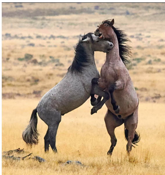
Wild Horses by Roy Killen