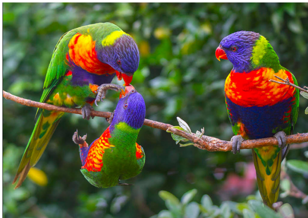
Enough of your cheek by Diane Schofield

Four of the six images in this round received honourable mention awards. They were: