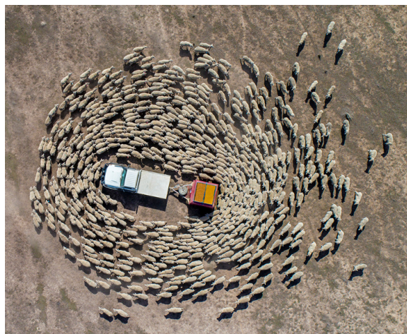
Centre of Attention by Margot Hughes

The other two images submitted for this round were