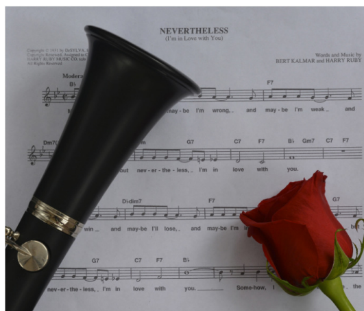
The Romance of Music - by Terry Biden

Photojournalism entries shall consist of images with informative content and emotional impact, reflecting the human presence in our world. The journalistic (story-telling) value of the image shall receive priority over pictorial quality. In the interest of credibility, images that misrepresent the truth, such as those from events or activities specifically arranged for photography or of subjects directed or hired for photography, are not eligible. Techniques that add, relocate, replace or remove any element of the original image, except by cropping, are not permitted. The only allowable modifications are removal of dust, scratches or digital noise, restoration of the existing appearance of the original scene, sharpening that is not obvious, and conversion to greyscale monochrome. Derivations, including infrared, are Not eligible.