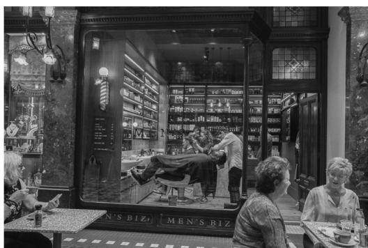
The Barbers Shop Revival