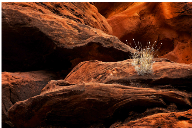
Survivor - by Barbara Hunter

The Club is currently sourcing a new calibrating device that will be suitable for all operating systems.