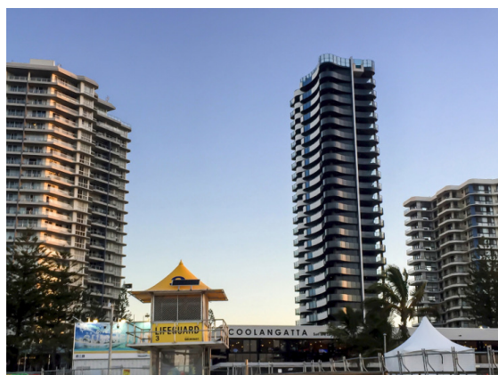
Gold Coast 2 - by kaylei-jtowers

Roy will discuss the common problems that members face when trying to capture and process images, and suggest some solutions. Any members who have a particular problem they would like solved are invited to email Roy as soon as possible so that the problem/solution can be included in the presentation