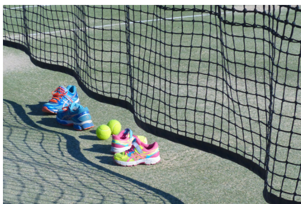
Line Up