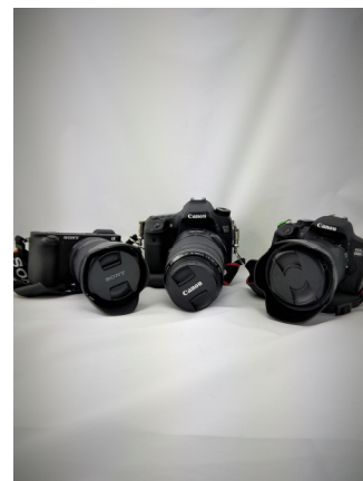
So many toys, so little time!

I have found being involved in the club has really stretched my photography skills and made me think more 'out of the box' in terms of what makes a good image. I particularly enjoy the set subjects - they really make me think creatively and put me to the test in many ways.