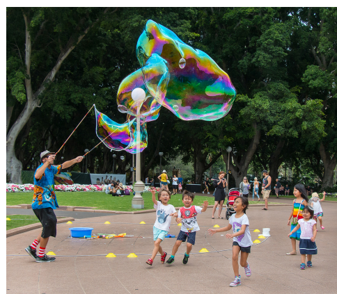
Chasing Bubbles - by Lee-Ann Hattander

http://www.abc.net.au/news/2018-04-16/what-law-says-about-taking-photos-of-people-in-public/9641488